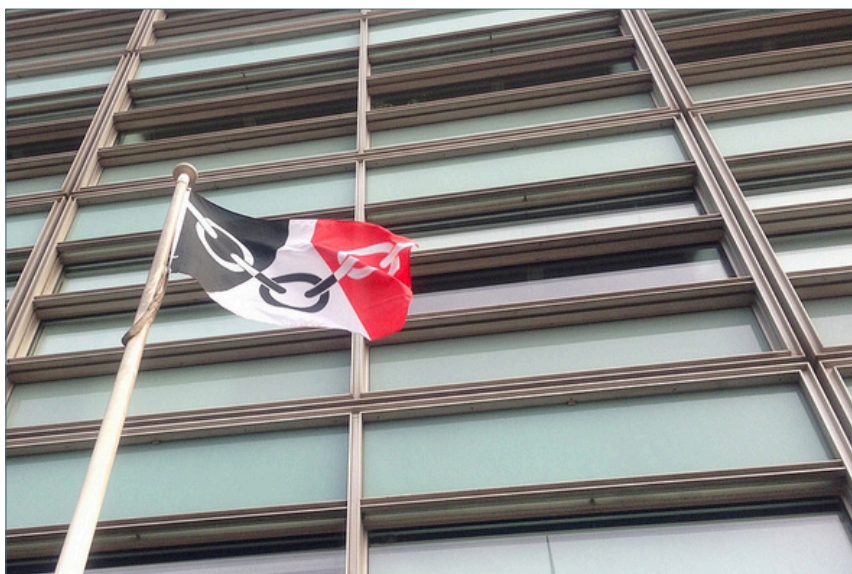
Simple yet distinctive designs are easily recognisable at a distance.

The flag's elements, colours, or patterns should relate to what it will represent. The flag should symbolise the area as a whole rather than any other entities which are better served by having their own flags (ie. try not to symbolise specific towns or the country)