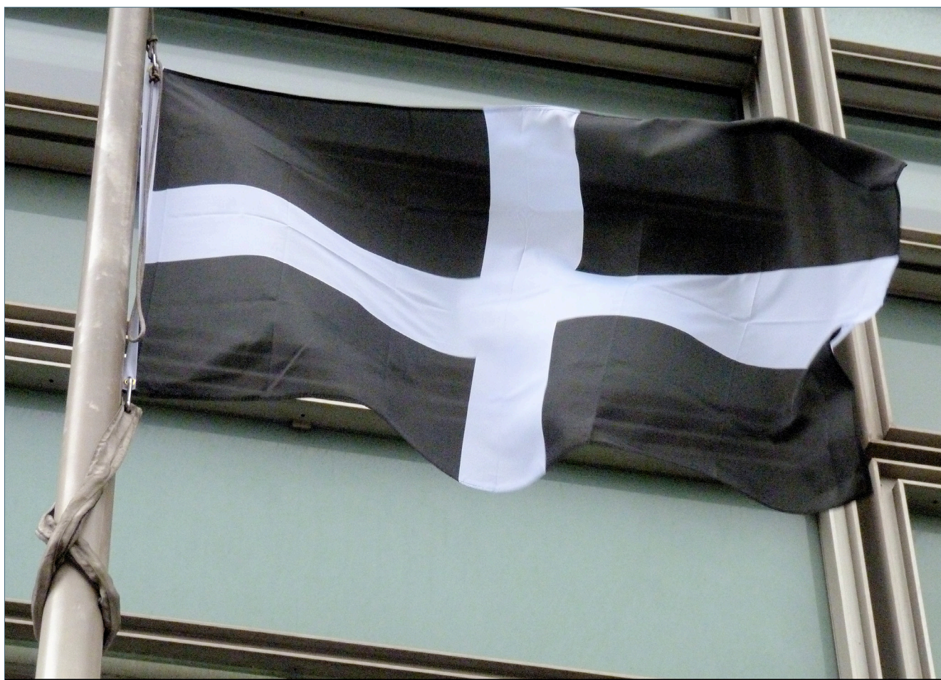
The Flag of Cornwall

A traditional design can also be entered into a public design competition of the kind described elsewhere in this guide.