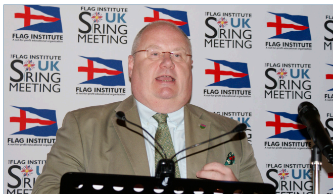
The Rt Hon Eric Pickles MP unveiled his plan to liberalise flag flying regulations at the Flag Institute Spring Meeting

And they matter as much as ever today. They give people a way of saying “we belong.” Whether that is to their nation, their county, their sports club or their school.