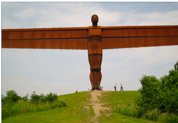
Angel of the North. Symbols may be found in the countryside as well as in villages, towns and cities.