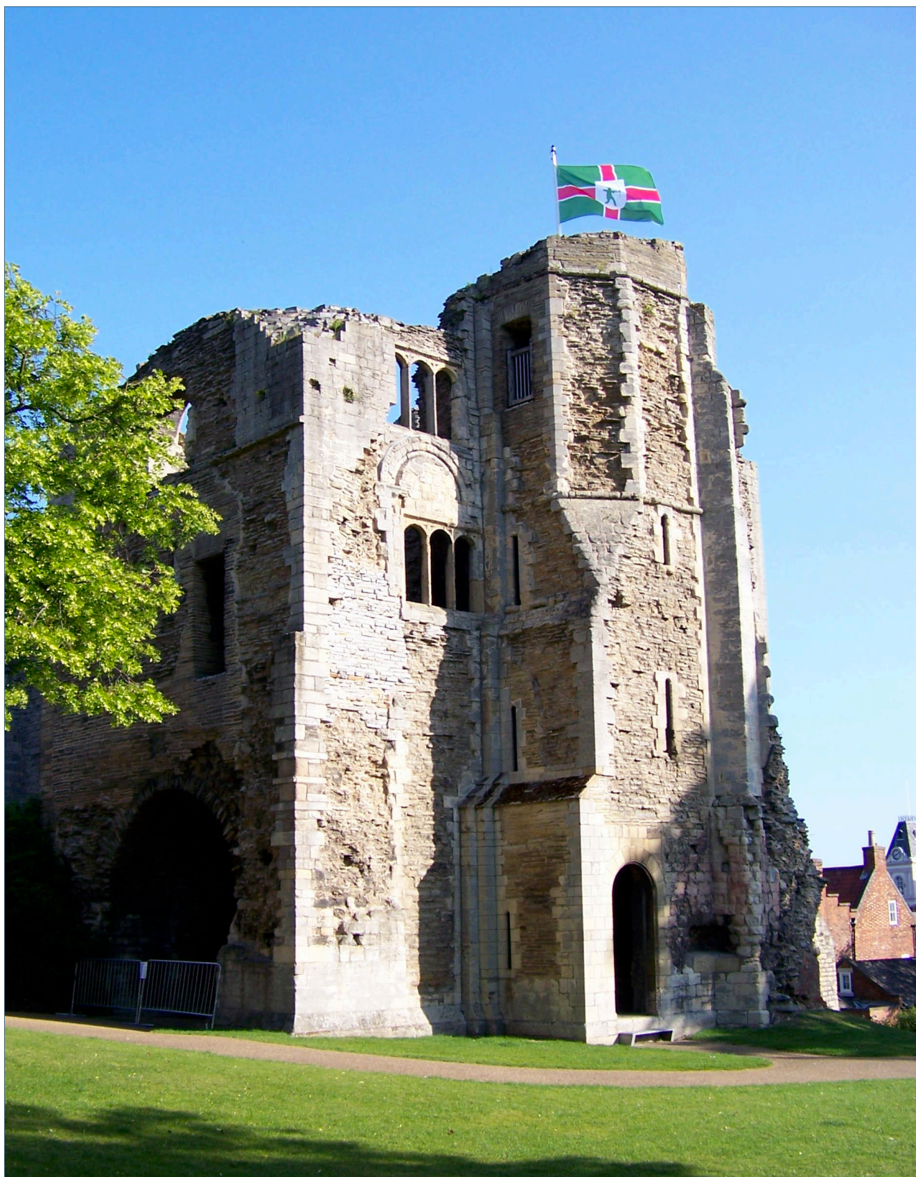
The flag of Nottinghamshire on launch day

“Both flags needed further publicity to get the message across that they existed, but both are now widely flown on flag poles in locations ranging from people’s gardens to council buildings. There is no copyright on the flags as they belong to the people of each county! As such, anyone can use them however they wish and the flags have been turned into car stickers, pin badges, embroidered on clothing, incorporated into letter heads, used on businesses websites etc.”