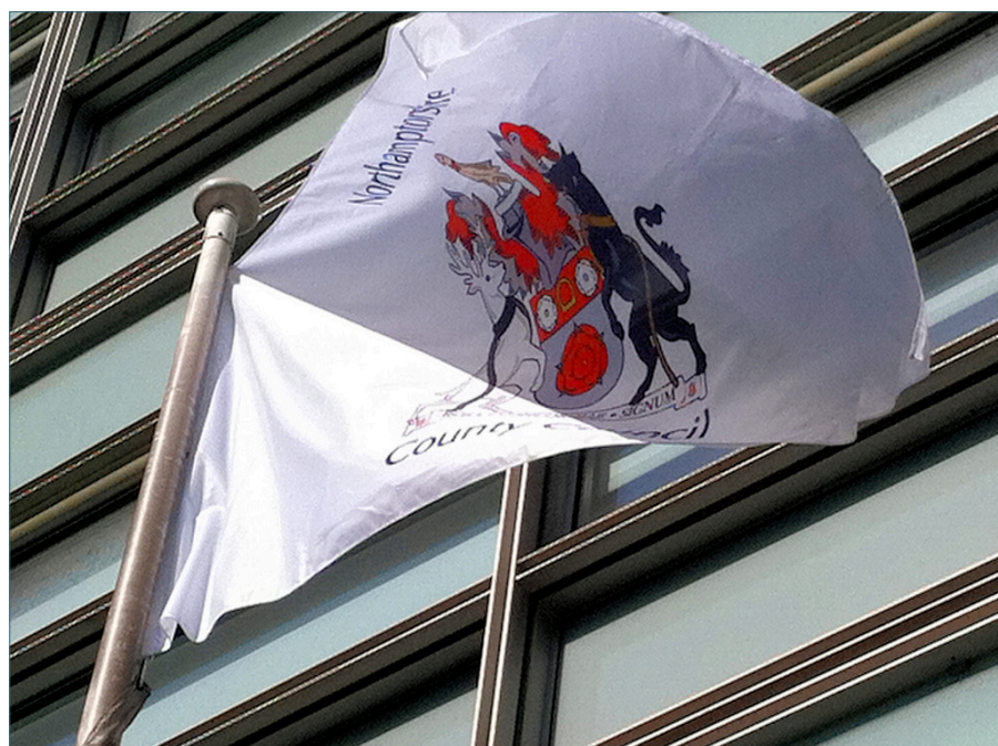
Complex designs, especially those with text, can be hard to make out even close-up.

Avoid the use of writing of any kind or an organisation's badge, seal or coat of arms. Writing and other intricate detail is difficult to see at a distance and will likely be unrecognisable when the flag is flying in the wind. It is better to use elements from an appropriate coat of arms as symbols on the flag.