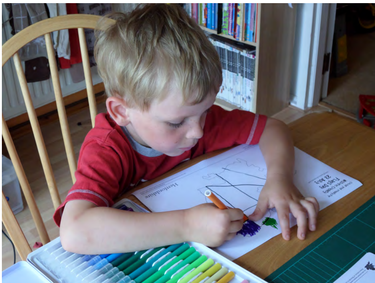
A willing volunteer tries-out one of the county colouring sheets (Association of British Counties)

Historic County Flags Day aims to get as many county flags flying across the United Kingdom as possible on one day, Wednesday 23rd July 2014, to celebrate the nation's historic counties. As part of the festivities, the Association of British Counties encourages schools and clubs to join-in, and the colouring sheets are a perfect activity for the day.